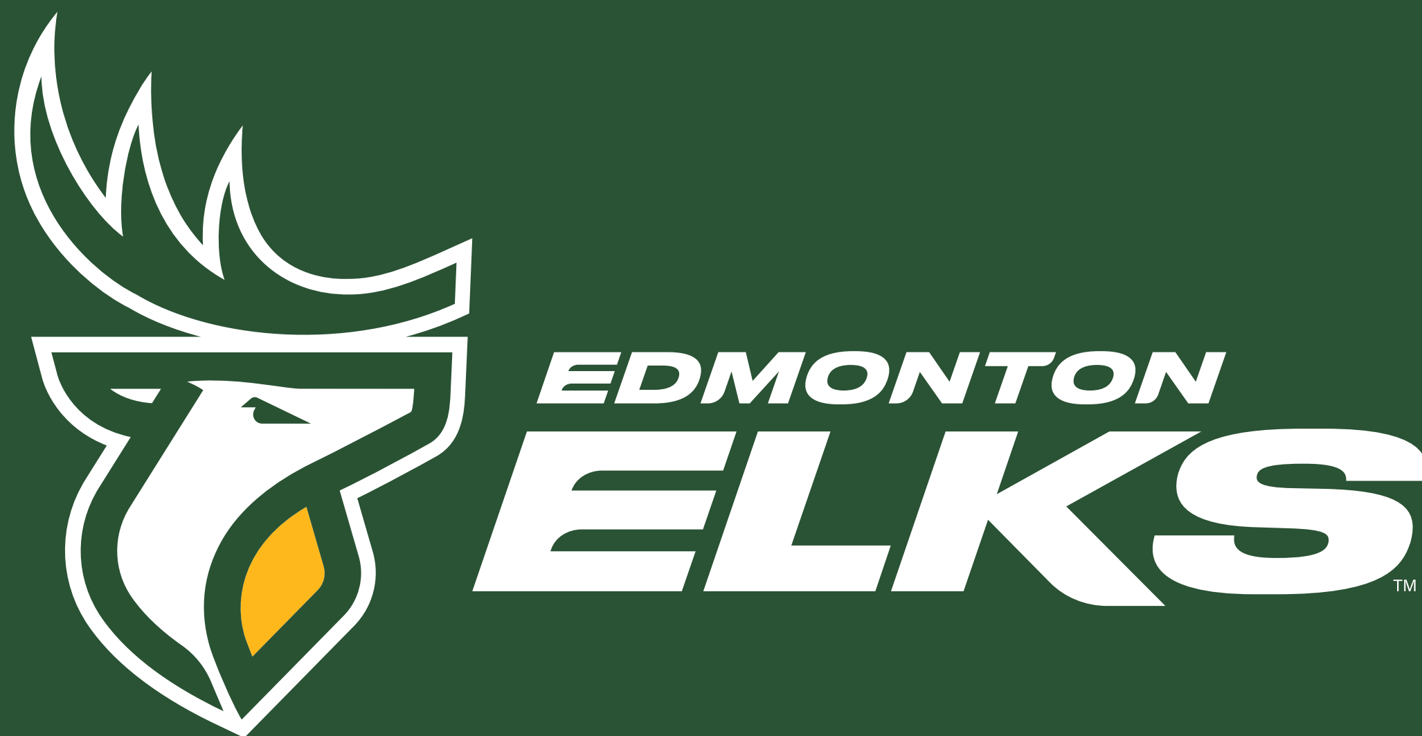
Full lockup logo